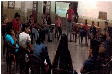
Our college and career group